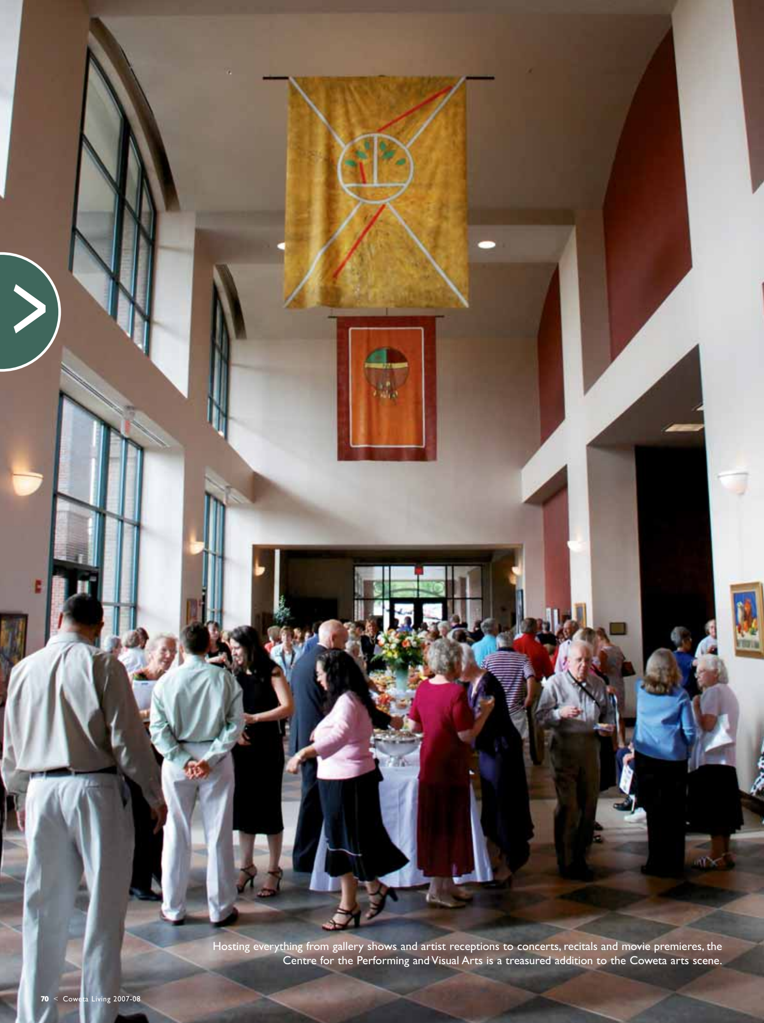
Hosting everything from gallery shows and artist receptions to concerts, recitals and movie premieres, the Centre for the Performing and Visual Arts is a treasured addition to the Coweta arts scene.